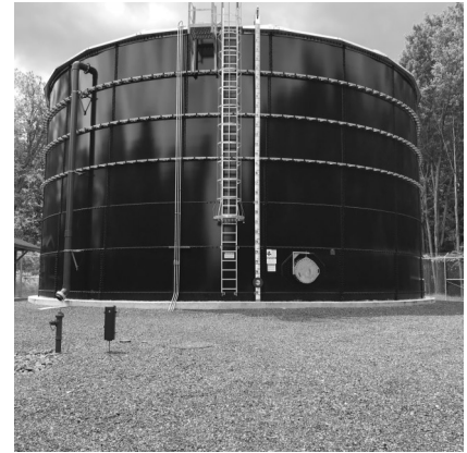
Camp Sunshine Water Tank built in 2018; 500,000 gallon capacity. Located off Chalybeate Road.

In the event of a prolonged electrical outage or water shortage, BTMA and Bedford Borough